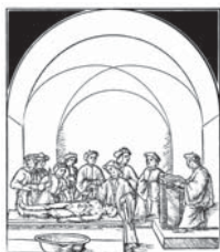
CENTRE FOR THE STUDY OF MEDICINE AND THE BODY IN THE RENAISSANCE